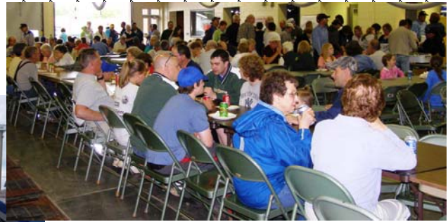
The City Picnic on June 12th was sponsored by Michels Pipeline. About 750 people attended.